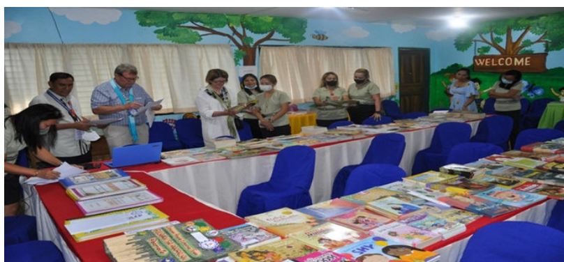
Teachers and leaders learning together.

Magic Libraries has generously provided the funding for the 6120 books required to implement the scheme across both Talomo A and Talomo B Districts in all fifteen schools, along with the training and development and teacher's resources required. AFFLIP is extremely grateful for their support.